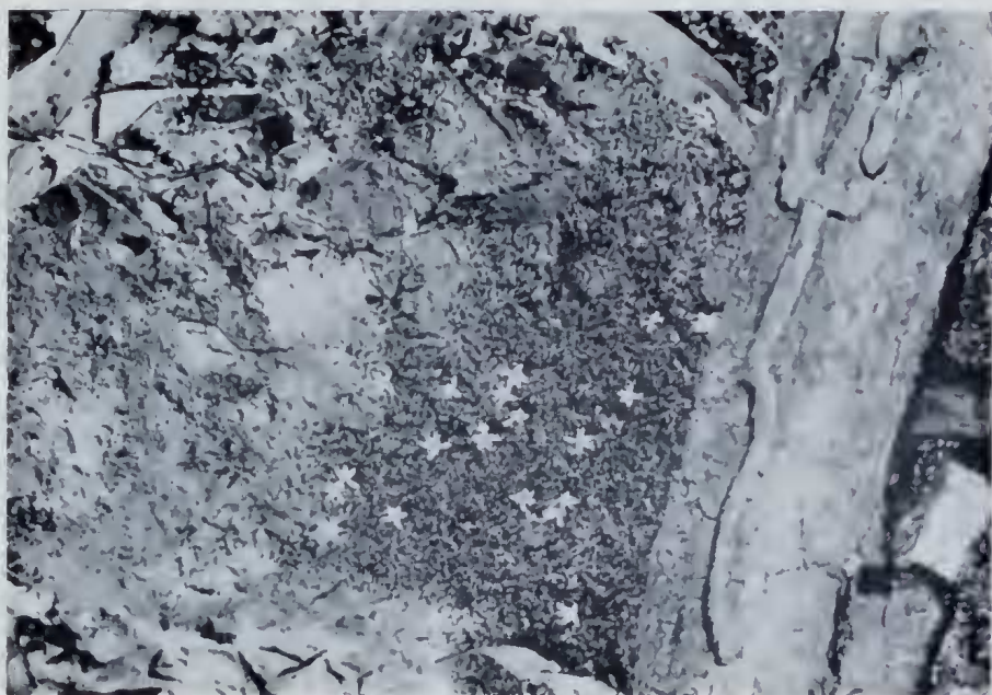
Isotoma fluviatilis growing in damp soil beside a billabong.